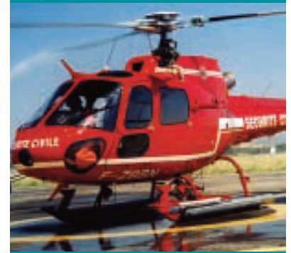
Wire strike protection, floatation gear and hailers

protection, floatation gear, hailers, sand prevention filters, search light, roping systems...and the list goes on.