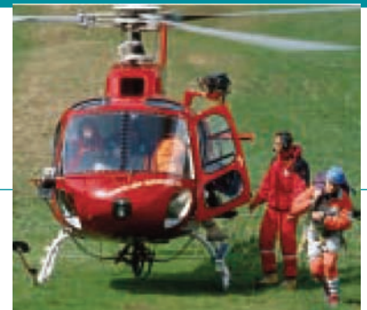
Cargo swing system

The Ecureuil family, which clocks more than one million flight hours every year, has already achieved more than 21 million flight hours! A large array of optional equipment is available: electrical hoist, cargo swing system, cargo sling with external mirrors, wire strike protection, floatation gear, hailers