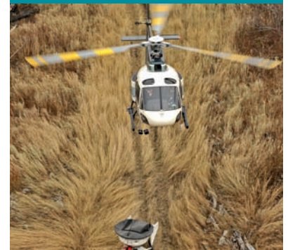
Cargo sling with external mirrors